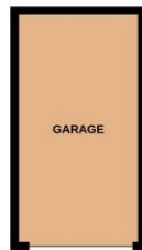
1ST FLOOR 399 sq.ft. (37.1 sq.m.) approx.